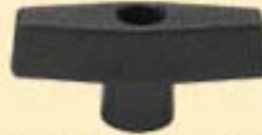
3088/3089 Thru Hole